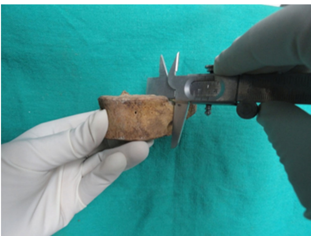
Figure 2: Pedicle width ( w ) measurement (lateral view)