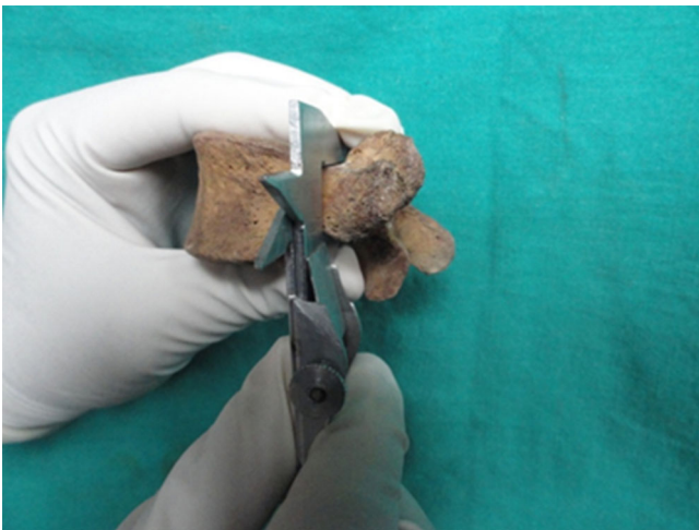
Figure 1: Pedicle vertical height ( h ) measurement (lateral view)

Pedicle vertical height ( h ) and pedicle width ( w ) of atypical dry human lumbar vertebrae were measured. Mean, standard deviation, range, p -value, and correlation coefficient for height and width are given in Tables 1 and 2. For both height and